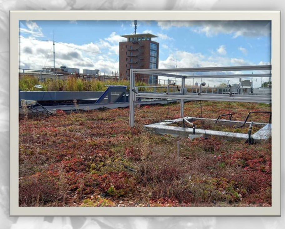
Photo: The extensive green roof at the UFZ Research Green Roof in October 2021 Author: Lucie Moeller, UFZ

More information on the UFZ Research Green Roof: http://www.ufz.de/forschungsgruendach